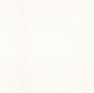
Matte White Lacquer - MWL